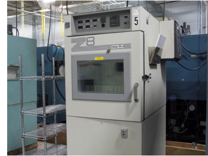
Environmental and Climatic Testing