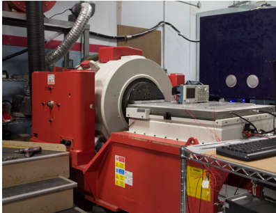
Vibration and Shock Testing

As a third-party test provider, we offer customers a diverse knowledge base that comes from testing a range of products and components for a variety of industries for over 65 years. Our experienced engineers and technicians are ideally suited to recommend the best solution for each customer and project.